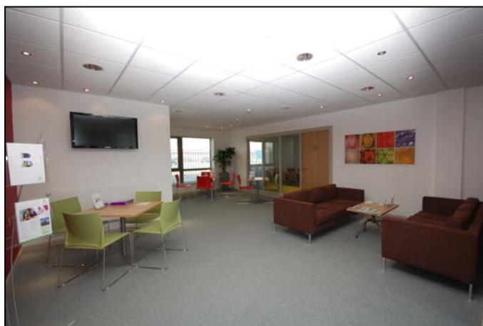
Above: Breakout area in main Business Centre