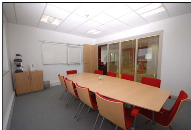
Above: Meeting room available for hire